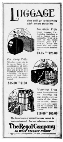
Figure 2; York Daily Record, July 1927, "new zippered cases"

"Each year motoring becomes more and more a favorite pastime as weekends grow in popularity..." according to the June 1931 issue of Good Housekeeping. This sentiment is very similar to the short tours so many of our chapters take each year. Do you and a few Model A friends like to take day trips and pack a lunch? Have a little fun with it! One of my favorite trips involved the Southeastern Touring group and a trip onto the Blue Ridge Parkway. My husband and I packed a lunch and brought our picnic set