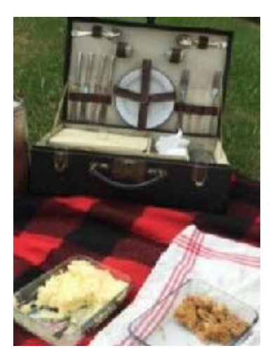
Figure 1; Picnic set

along. Add some fried chicken, potato salad, and lemonade for a trip you won't soon