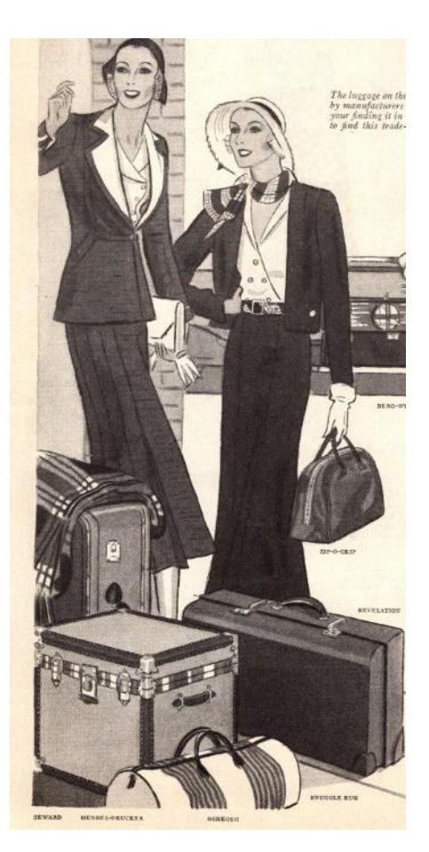
Figure 3, Luggage from June 1931 Good Housekeeping

Next time you travel in your Model A, think about your luggage and packing for the era. Many of these suitcases, duffles, and trunks can be found on eBay or in antique stores, for a decent price. Even if you only use it as a prop in your "A," or for your next trip down the runway at a fashion judging event, you'll be adding a little more authenticity to the occasion.